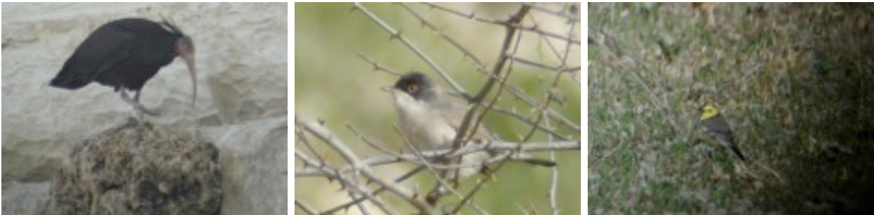
Bald Ibis, Menetries Warbler and Citrine Wagtail - birding highlights of southeastern Turkey.

I planned this trip with short notice during the 2004/2005 season in Egypt. I wanted to go to Lebanon but due to the political situation there I had to change my plans. Linus Blomqvist, a friend travelling in Turkey that Spring, was contacted and together we decided on this improvised, not-so-serious birding/culture trip through southern Turkey.