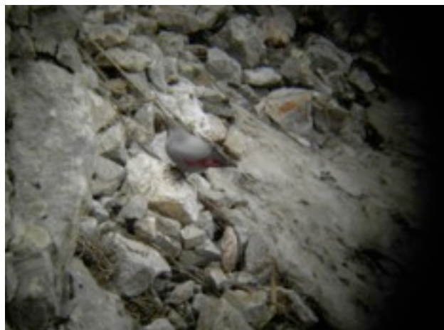
Caspian Snowcock and Wallcreeper at Demirkazik