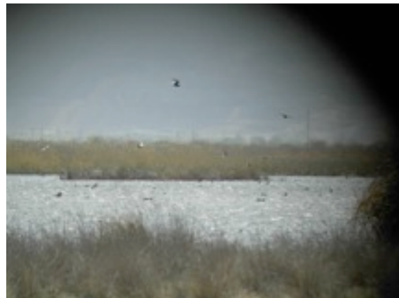
Cretzmars Bunting and the Sultan Marshes through the scope.

Yellow-vented Bulbul Black-crowned Accentor Alpine Accentor Isabelline Wheatear Black-eared Wheatear Rock Thrush Blue Rock Thrush Ring Ouzel Cettis Warbler Graceful Warbler Savis Warbler Moustasched Warbler Olivaceous Warbler Menetries Warbler Rueppells Warbler Orphean Warbler Eastern Bonellis Warbler